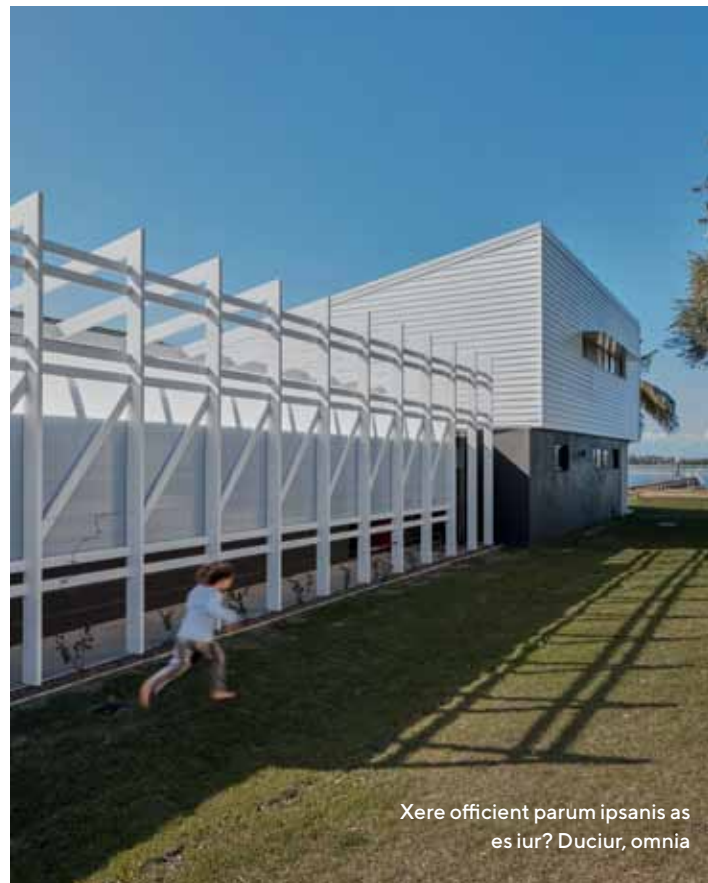
Xere officient parum ipsanis as es iur? Duciur, omnia

d own by the banks of Cabbage Tree Point on the Gold Coast sits a classic Australian tableau: a retired couple by the seaside leisurely checking their crab traps, while a gaggle of grandkids trails behind. Sitting squarely in the background of this serene scene is a house that marries form and function.