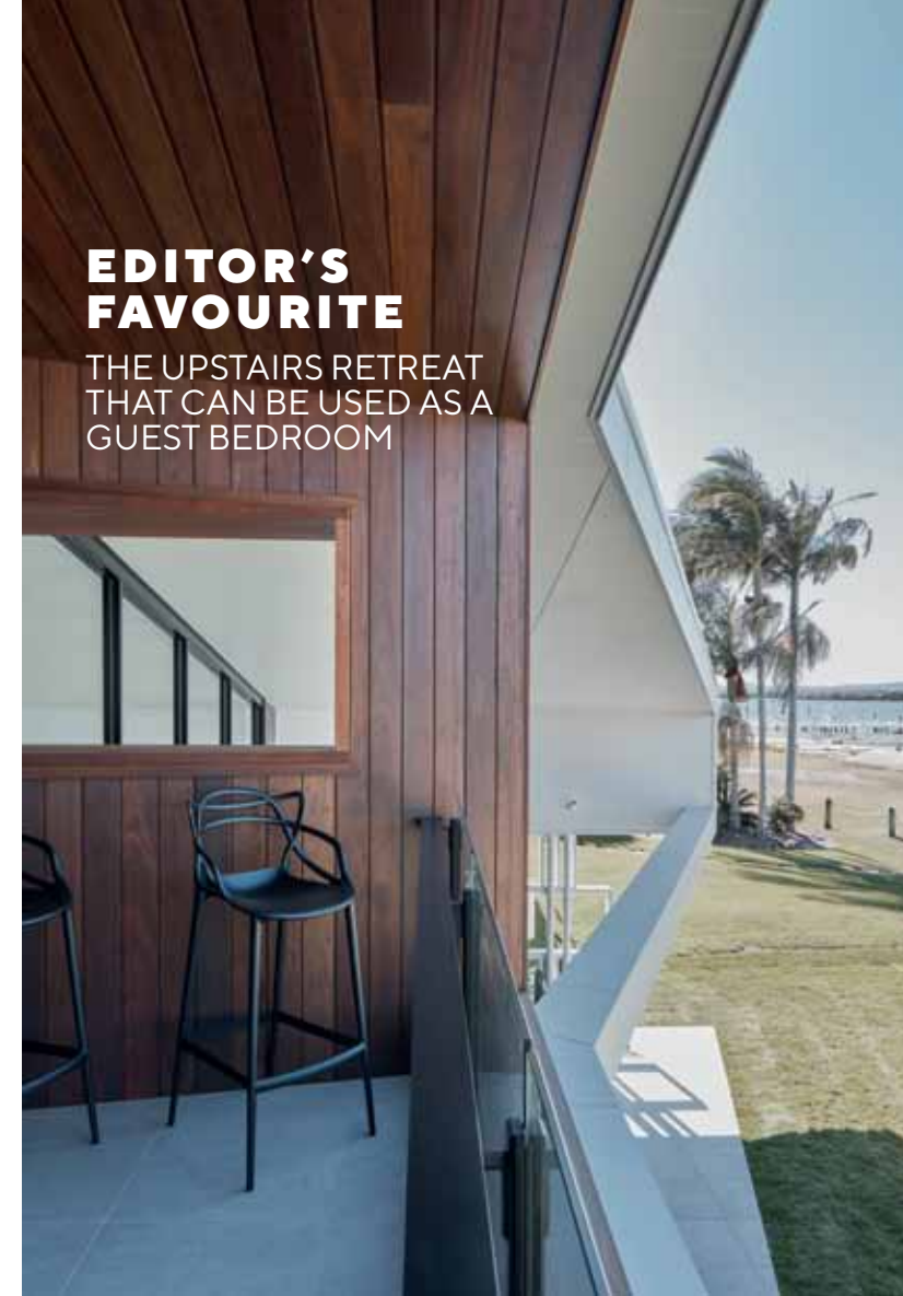
ABOVE Xere officient parum ipsanis as es iur? Duciu, omnia ABOVE RIGHT Xere officient parum ipsanis as es iur? Duciu, omnia BELOW LEFT Xere officient parum ipsanis as es iur? Duciu, omnia