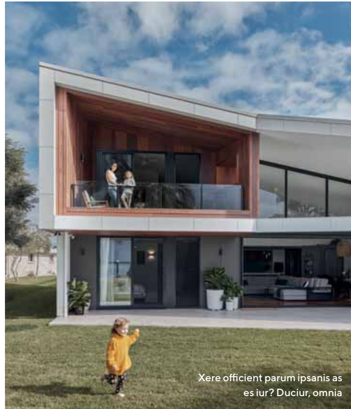
Xere officient parum ipsanis as es iur? Duciur, omnia