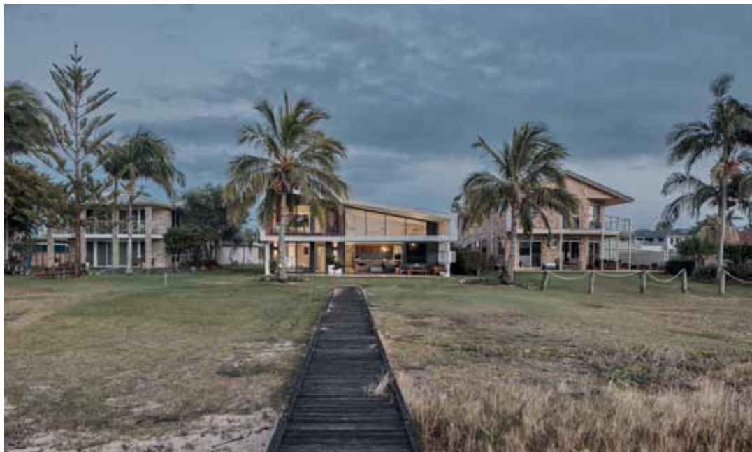
LEFT Xere officient parum ipsanis as es iur? Duciu, omnia ipsanis as es iur? Duciu, omnia